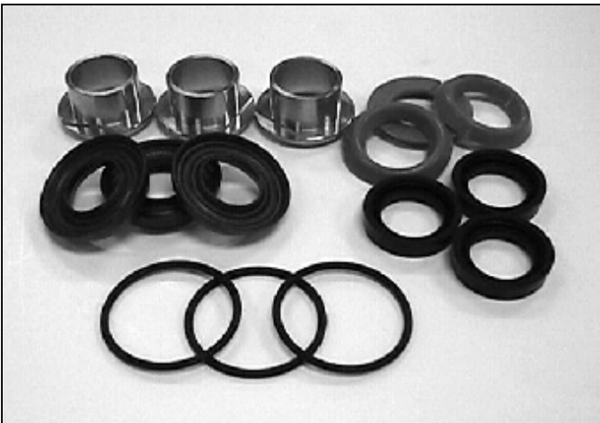
AR-1866 Water Seal Kits